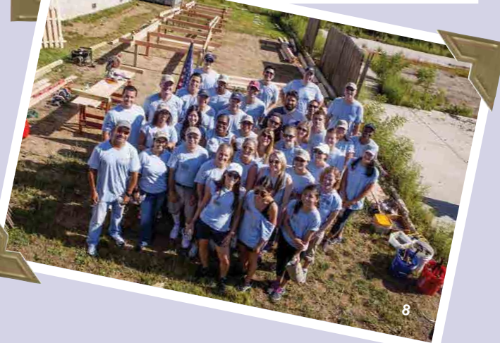
Shout out to all of our volunteer groups that have volunteered with us this year. Including: 1.) Enterprise 2.) Gap 3.) Credit Suisse 4.) Robert Wood Johnson 5.) SEIC Corporation 6.) Wells Fargo 7.) Wilson Memorial Church 8.) Ironshore Insurance